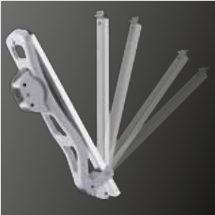
Pre-mounted die cast backstructure